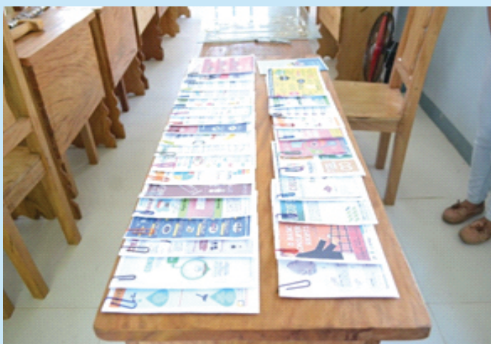
Community outreach in Brgy. San Miguelay, Santa Fe, Leyte